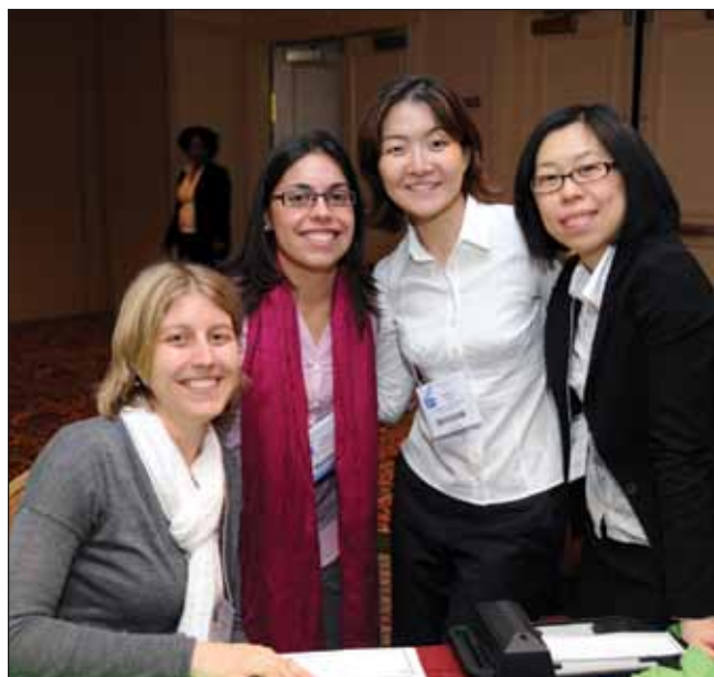
Student members sell t-shirts at ASN's Annual Meeting, that they designed.

We are excited to again have Student Co-Chairs assisting us with our mini-symposia next year. We hope this will provide students with a behind-the-scenes view of how we operate and create a more energetic environment during the sessions. In addition, we plan to again host a lunch session for students similar to last year's "Careers in Dietary Bioactive Components" including a panel discussion with professionals representing Industry, Academia and Government. We will also be seeking sponsorship for this event and announce the special topic for next year's student lunch session in Nutrition Notes soon.