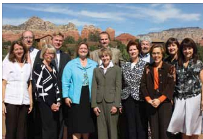
The Board of Directors discussed the new 5-year ASN strategic map at their fall meeting.