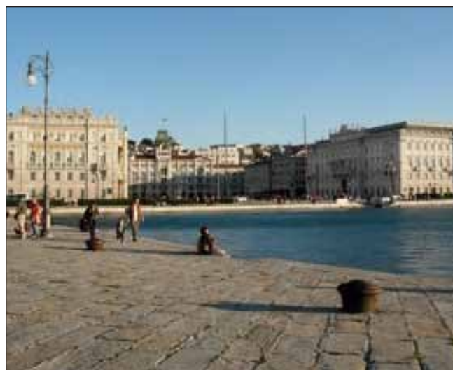
Trieste, Italy will host next fall's ISRHML Conference.

Registration will begin on November 30, 2011 at the ISRHML website ( www.isrhml.org )