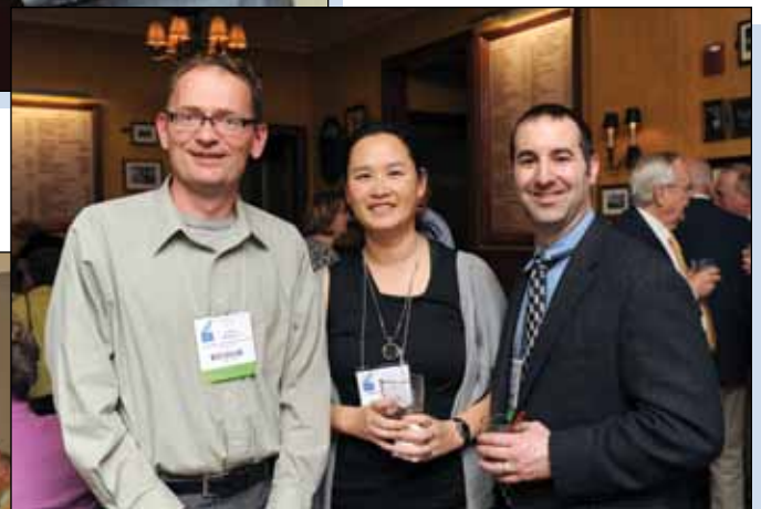
✓ Members and Editors enjoy the Journals Reception.