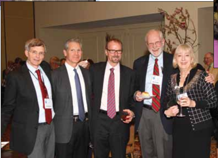
▲ ASN Awards, Donors and Sponsors Reception.