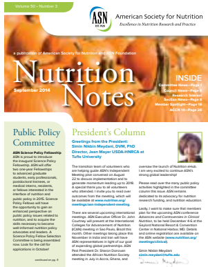
Volume 50, Number 3

Constituent Society of FASEB 9650 Rockville Pike Bethesda, Maryland 20814-3990