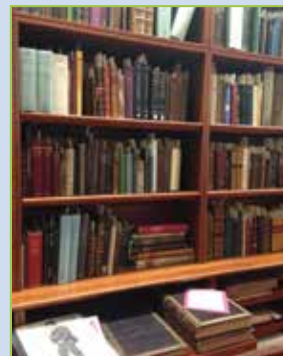
Darby Rare Books Collection