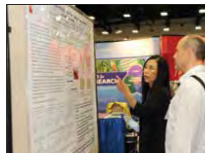
Nutrition posters were well-visited during EB 2012.