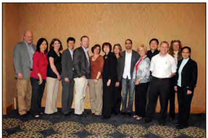
2012-13 RIS Chairs at EB 2012.