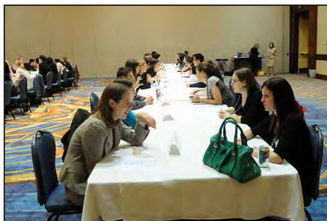
Speed mentoring was a huge success at EB 2012.

If you are further along in your career, you have the opportunity to mentor students or entry level professionals. Each of the 15 RIS have integrated mentoring into their current and long-range objectives. An example of an