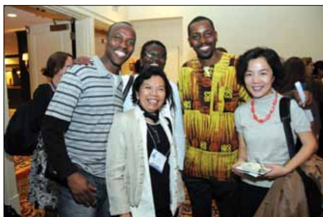
INC members enjoy their EB2011 reception with old and new friends.