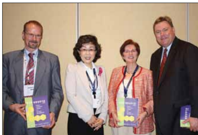
ASN leaders are excited to show off Dietary Reference Intakes for Koreans, First Revision.