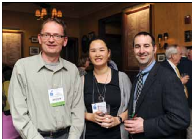
Editorial Board members are eager to celebrate their hard work during the Annual Meeting reception.